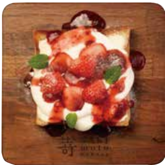
Open Sandwich Strawberry Custard 開放式三明治 草莓吉士醬 1,200 yen

Seasonal Limited SAKURA SWEETS Caramelized Toast with Sakura Mont Blanc 焦糖吐司配櫻花蒙布朗 1,000 yen