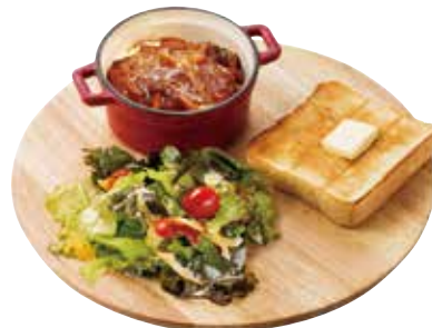
Stewed Hamburger Steak With Demi-glace Sauce