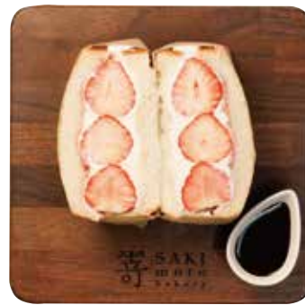
Gokubi Fruit Sandwich Strawberry 极美吐司水果三明治 草莓多多 1,100 yen