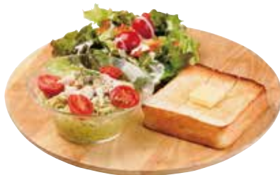
Cold Pasta Plate Tomato and Chicken Genovese