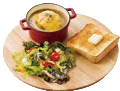
Soup Plate Onion Gratin Soup