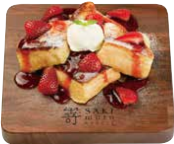
French Toast Strawberry 极美法式吐司 - 草莓田园