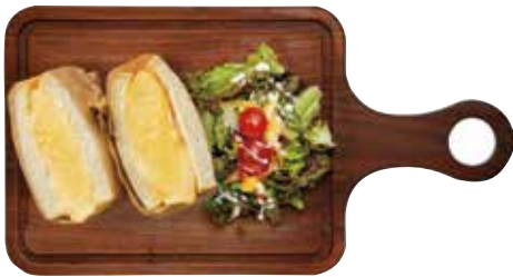
Thicc Omelette Sandwich 厚烧煎蛋极美三文治