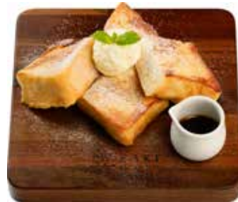
French Toast Plain 极美法式吐司 - 原味