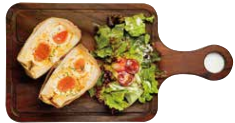
Soft Boiled Egg Sandwich 溏心蛋极美三明治