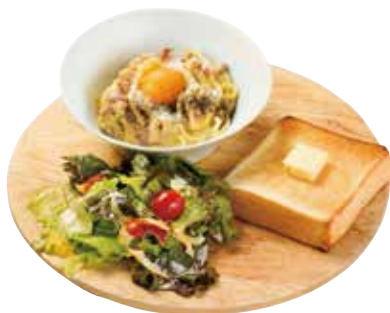
Pasta Plate Rich & Creamy Carbonara 意大利面餐盘 - 浓厚培根蛋面