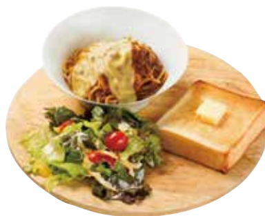
Pasta Plate Chef's Special Meat Sauce 意大利面餐盘 - 厨师特制肉酱