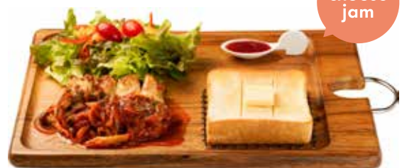
Special Plate Roast Chicken with Tomato Sauce