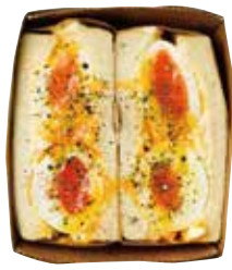
Gokubi Sandwich Half-cooked Egg