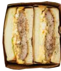
Gokubi Sandwich Teriyaki Chicken Thigh and Egg Salad