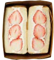
Gokubi Fruit Sandwich Strawberry