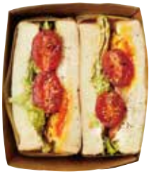
Gokubi Sandwich BLT