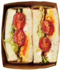
Gokubi Sandwich BLT