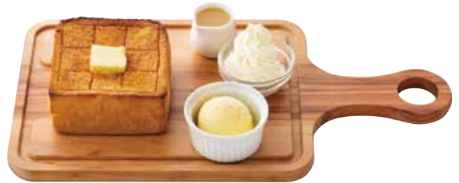
Honey Toast Plain