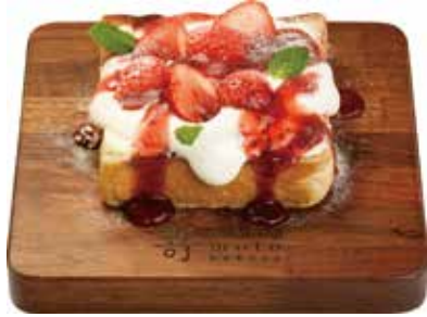
Open Sandwich Strawberry Custard