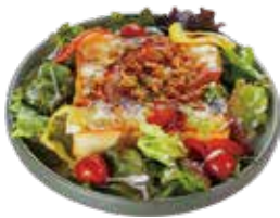
Meat and Cheese 肉酱芝士