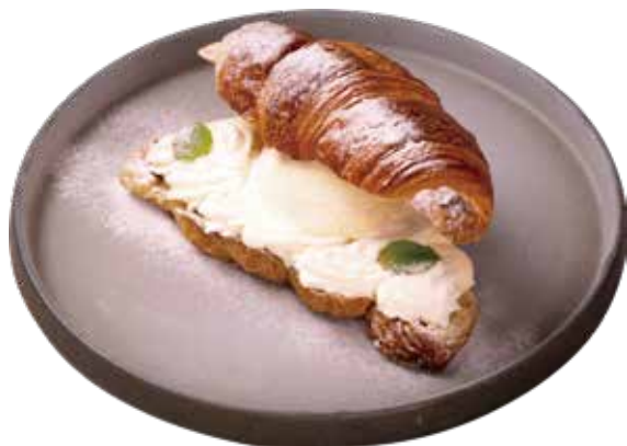
Brulee Croissant Plane 布蕾羊角面包 - 原味 1,000 yen