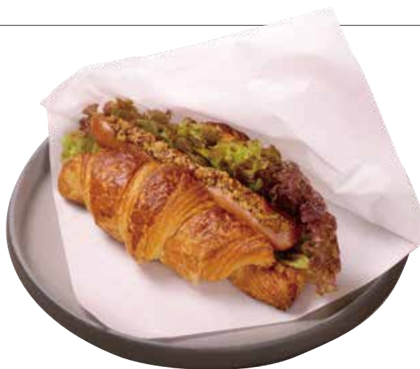
Croissant Hot Dog 牛角麵包熱狗 800 yen