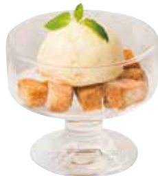
Sakimoto's Vanilla Ice Rusk