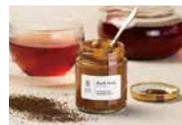
EARL GRAY 伯爵

The infusion of premium Sicilian pistachios results in a sumptuously creamy texture and a delicately sweet, savory flavor that harmoniously blends to create an irresistibly addictive taste.