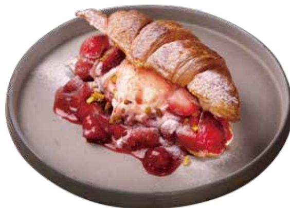
Brulee Croissant Strawberry 布蕾羊角面包 - 草莓田园 1,300 yen