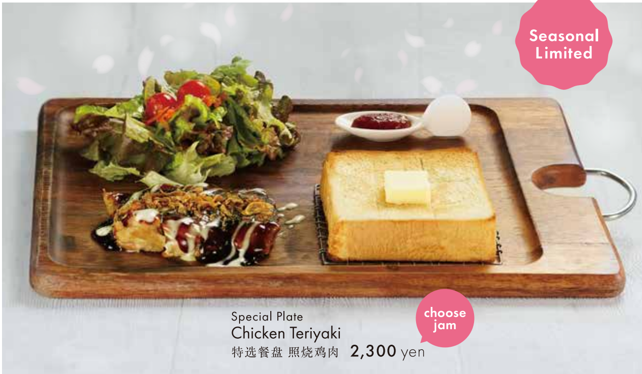
Special Plate Chicken Teriyaki 特选餐盘 照烧鸡肉 2,300 yen