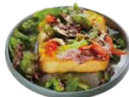
Mushroom and Bacon 蘑菇培根