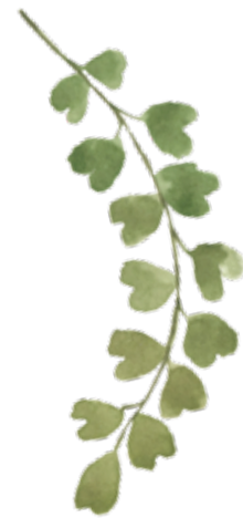
Yuzu Pepper Pasta with Rape Blossoms and Whitebait 油菜花银鱼意面配柚子胡椒