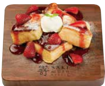
French Toast Strawberry 极美法式吐司 - 草莓田园