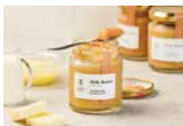
MILK BUTTER 牛奶黄油

Additional toppings 1 types of jam 200 yen 追加配料 1 种抹酱